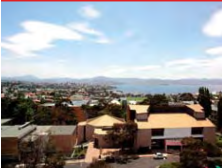
Hobart UTAS Campus