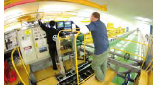
Australian Maritime College